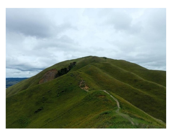
Picture 1. "Bukit Holbung Hariara Pohan", Samosir (Holbung Hill)

bathing. The village's main attraction is Holbung Samosir Hill, which offers natural views of the stunning Toba caldera environment. Holbung Samosir Hill in Hariara Pohan Village is a village-owned business (BUMDes). Holbung Hill is popular among both local and international tourists who want to camp or simply enjoy its beautiful natural scenery. Tourists who want to enjoy its natural beauty must climb up and down multiple stairs before taking the path. Aside from that, there are open spaces for camping. Tourists spend an entrance fee of IDR 5,000 per person, while parking costs IDR 5,000 for motorcycles and IDR 10,000 for vehicles.